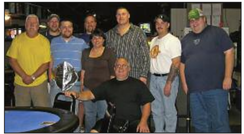
Winners and More

Along with the tournament players there were more than 20 others who showed up to play cash games, buy raffle tickets or bid on the silent auction items. In total, this event