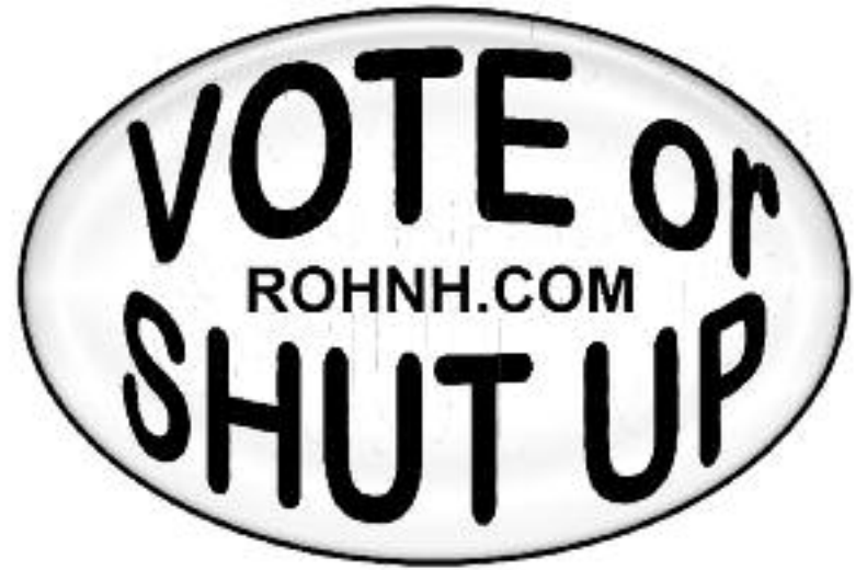
This is a bumper sticker that was handed out at the Candidates' Forum last Tuesday, February 23.

For those who have not been able to attend one of these forums there is a short contribution from several of the candidates in this issue of Trendy Times. We hope those who will vote on March 9 will