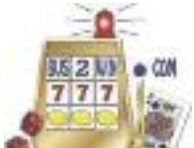
Bus2Win.com / bingotrips.com