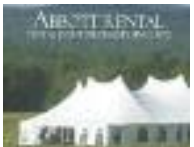
Abbott Rental & Party Store