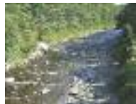
Twin River Campground