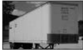
Storage Trailers 28' - 48'