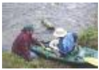
Paddle the Border Spring Event

Support these advertisers by becoming a fan!