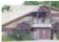
Warners Gallery Restaurant