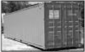
Ground Level Containers 20' - 40'