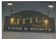
The Little Grill