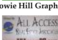
Cowie Hill Graphics