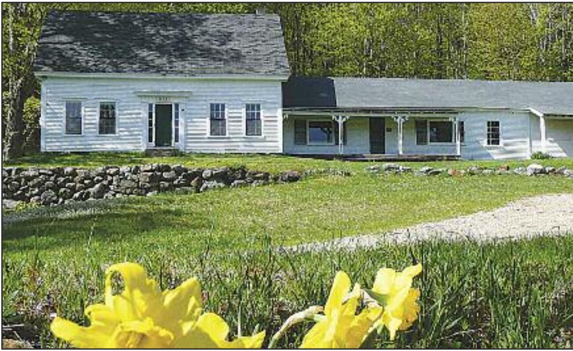
Lodging for the Artist-In-Residence will be at the Mead Base Lodge in Center Sandwich.

In celebration of the Weeks Act Centennial, the White Mountain National Forest (WMNF) is partnering with the Arts Alliance of Northern New Hampshire to offer its first-ever Artist-in-Residence program, and is seeking applications from interested artists in all media. The deadline for applications is June 6.