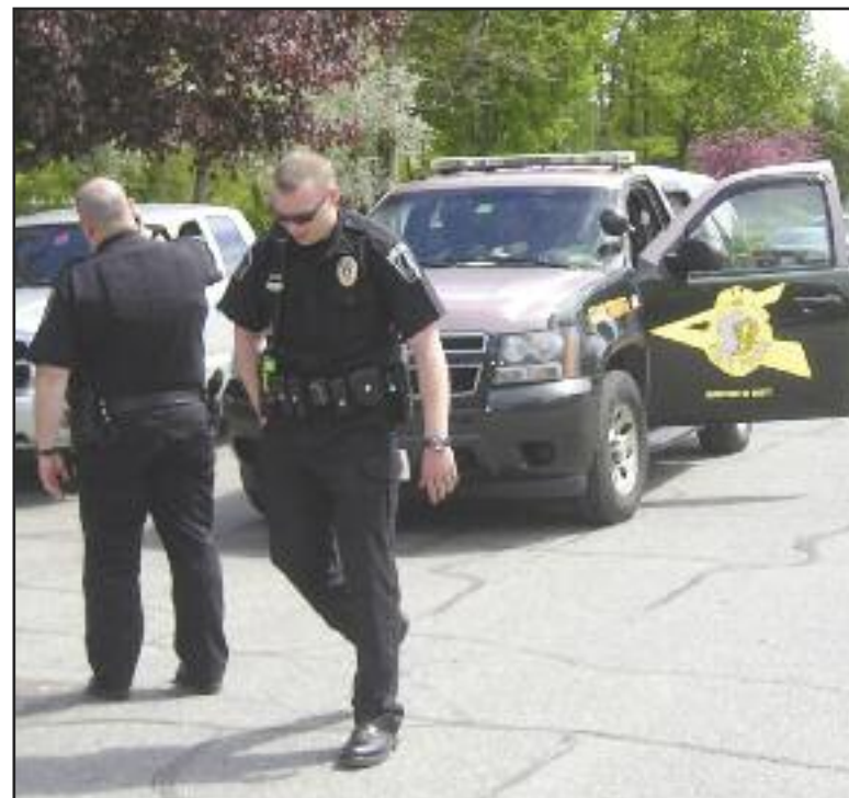
There was no lack in man power and plenty of cooperation between departments during the Thursday, May 19th "Bomb Threat" at the Woodsville Schools.