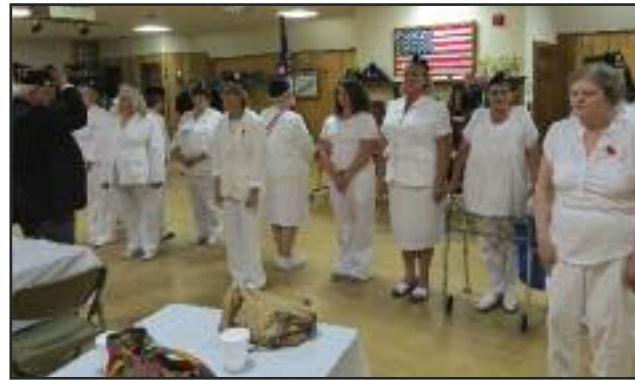
It was a special Installation of Auxiliary Members on May 10 at the American Legion Post in Woodsville. Not only were the ladies of Ross-Wood Post #20 American Legion Auxiliary sworn in, but also members from the Gorham Post #83. Also shown in this picture are some of the installation team from District 8. This meant that a total of five groups took part in the annual ceremonies hosted by Ross-Wood Post #20.