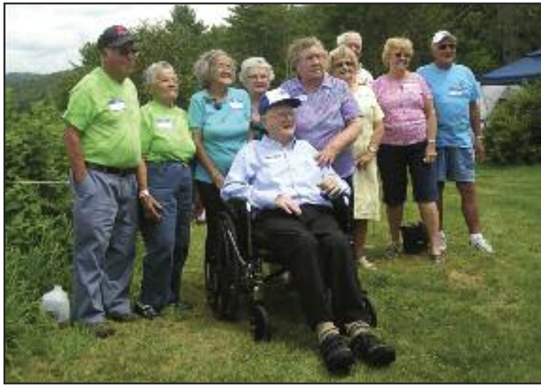
Saturday, July 20 was the date for the Robie Reunion in Piermont. Close to 100 descendants and spouses of the Robie family were on hand for a potluck lunch, entertainment, door prizes and even some "true" stories. Pictured left are members of the 10th generation of the Robies and below is generation #11. The Robie Farm has been in the family since 1861.