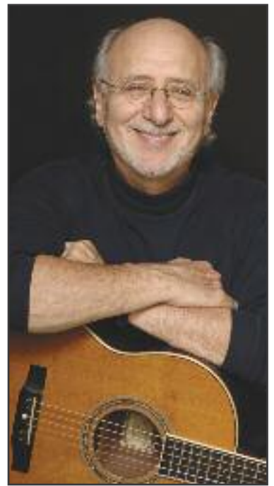
Legendary singer-songwriter Peter Yarrow joins an exciting new season of music, dance and theater at Court Street Arts in Haverhill.