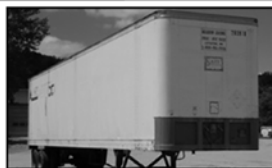
Storage Trailers 28' - 48'