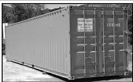
Ground Level Containers 20' - 40'