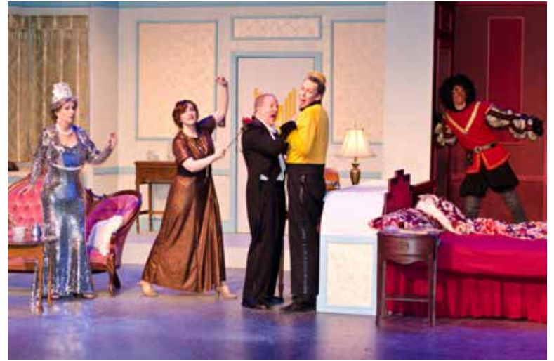
Ken Ludwig's Lend Me a Tenor, July 2015. Another Ken Ludwig comedy, Leading Ladies, opens the season at Jean's Playhouse on June 23, 2016.

The laugh out loud comedy Leading Ladies, by Ken Ludwig, opens our 30th season from the heart with two down-on-their luck Shakespearean actors that resolve to pass themselves off as a wealthy elderly woman's beloved nephews to get her cash, only to discover that her inheriting relatives aren't nephews, but nieces! Leading Ladies will play June 23rd-July 9th, Thursday, Friday, and Saturday evenings at 7:30 pm, and Wednesday afternoons at 2:00 pm on June 29th and July 6th. Join us on Thursday, June 23rd, for our Opening Night Gala Event here at Jean's for a delicious, locally catered dinner and musical entertainment before the show! The party doesn't end at the close of the curtain- enjoy some champagne and dessert while you meet the per-