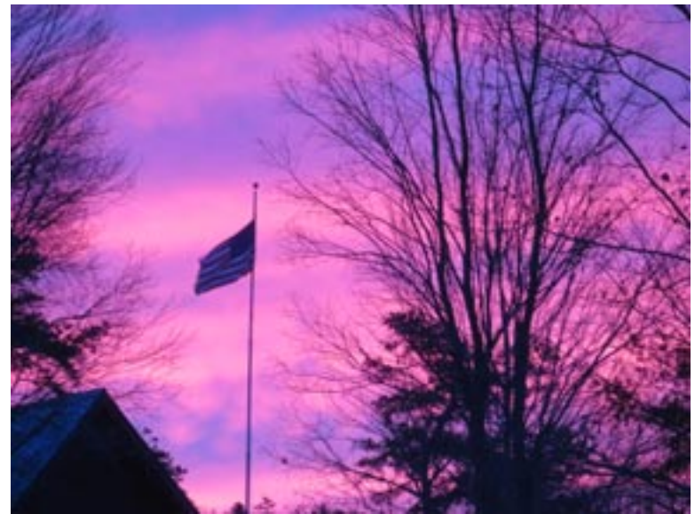
Sunrise behind the American Legion building in Woodsville.