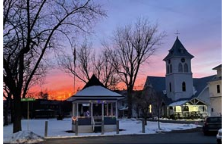
Photo of the Church and Band Stand in Fairlee, VT with the beautiful sunset in the background.

Photo by Cyndi Wellman If you would like a copy contact: cnb.pics07@gmail.com