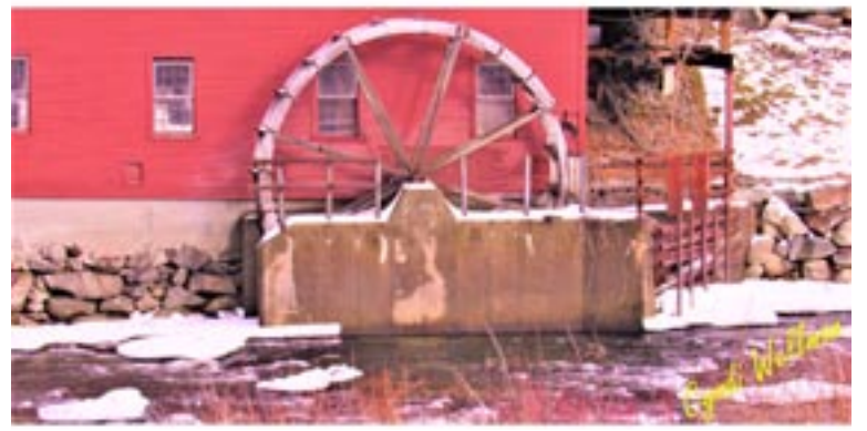
You can see the Grist Mill and WaterWheel from the Riverwalk in Littleton, NH. In case you're wondering what river: Ammonoosuc River