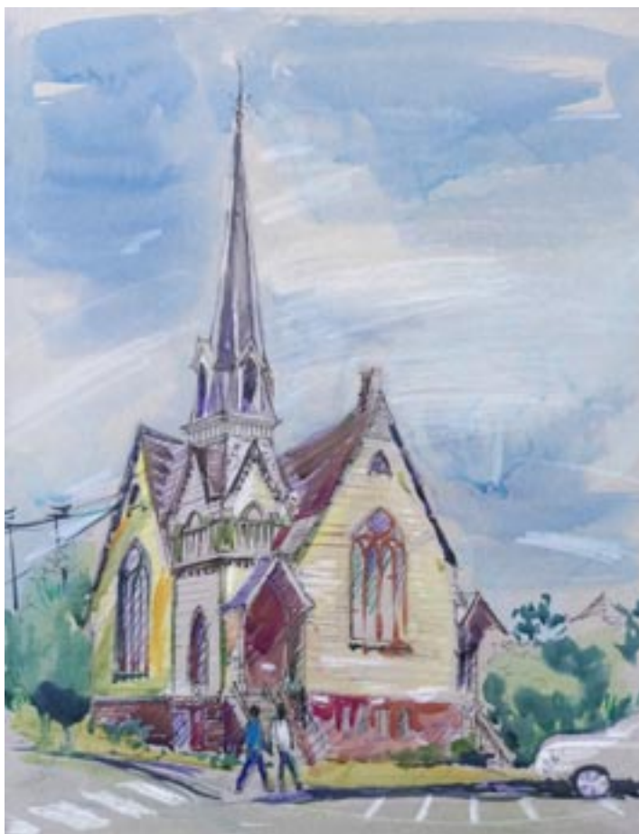
"Yellow Church, Main Street, St. Johnsbury" watercolor

Advertise In Trendy Times For Just $7 00 Per Column Inch (this size ad just $84 00 or less to tell 9,000 plus readers about you) Contact Gary at 603-747-2887 or email gary@trendytimes.com