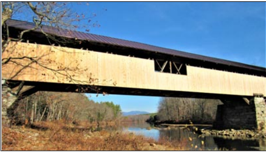
Scenery under Blair Bridge! Pemigewasset river in Camptom, NH